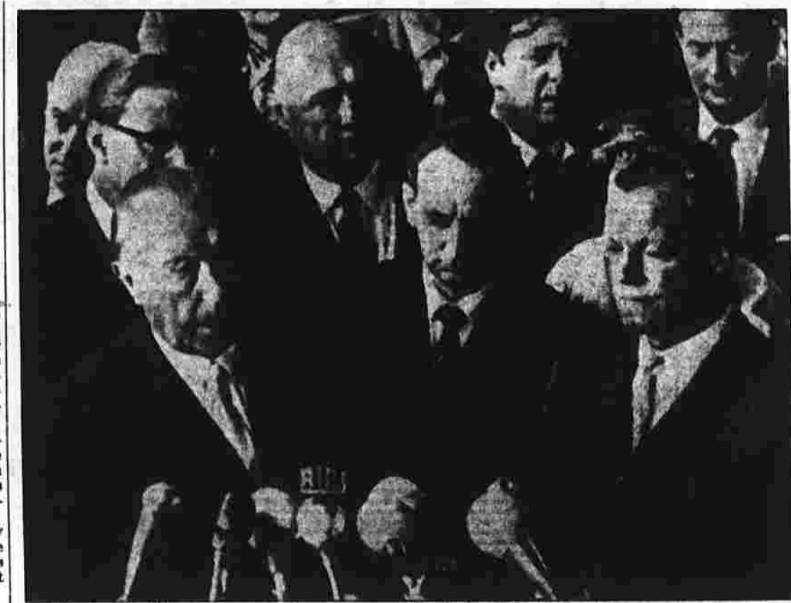
West German Chancellor Adenauer addresses crowds at West Berlin's Tempelhof Airport today.

Tokyo, Aug. 22 (AP)—Soviet First Deputy Premier Anastas Mikoyan today warned the western Allies with a warning to the western Allies that they must sign a peace treaty with Communist East Germany or lose their access to West Berlin.